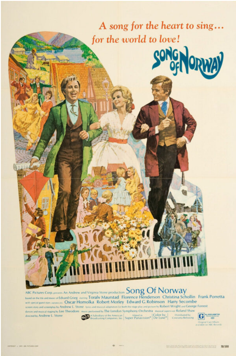
The 1970 film “Song of Norway” was based on composer Edvard Grieg’s life and filmed in Norway, where he lived. The soundtrack is Grieg’s music with added lyrics. (Cinerama Releasing Corporation)

Grieg was their homegrown boy made good, from the village of Bergen. He did them proud, just as Abraham Lincoln with his log-cabin roots made the people of the Midwest frontiers proud. Grieg made his whole nation proud.